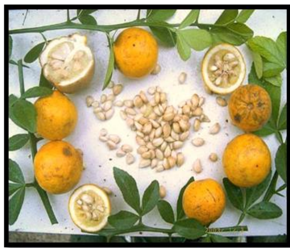
Fig. 1: Poncirus trifoliata ripened fruit and seeds

Ctrl = absorbance of control, Control value = 0.2602, Abs = absorbance of extracts